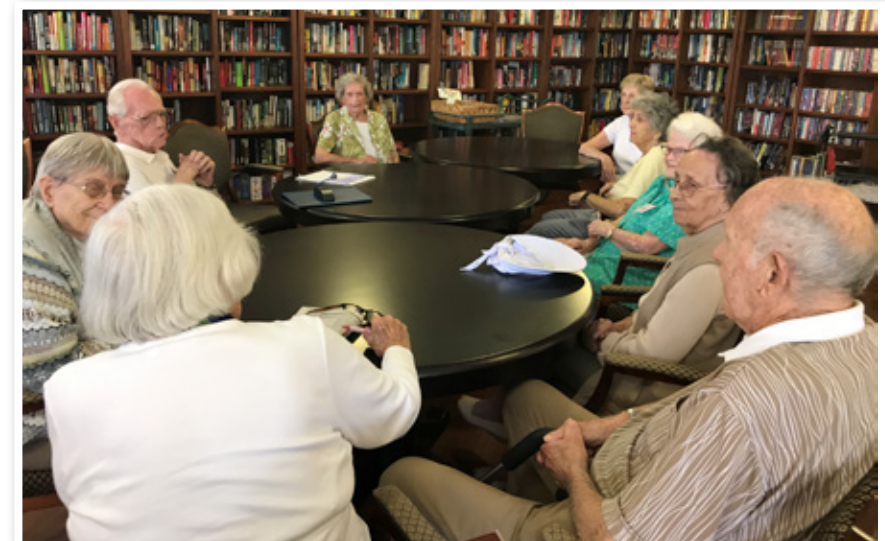
Glenbrooke's "Current Events Group" meets for discussion.

The group meets on Thursdays, at 1 p.m., in the Card Room. Join us. You can participate as little or as much as you like, and who knows, you just might come away learning something you didn't know before.